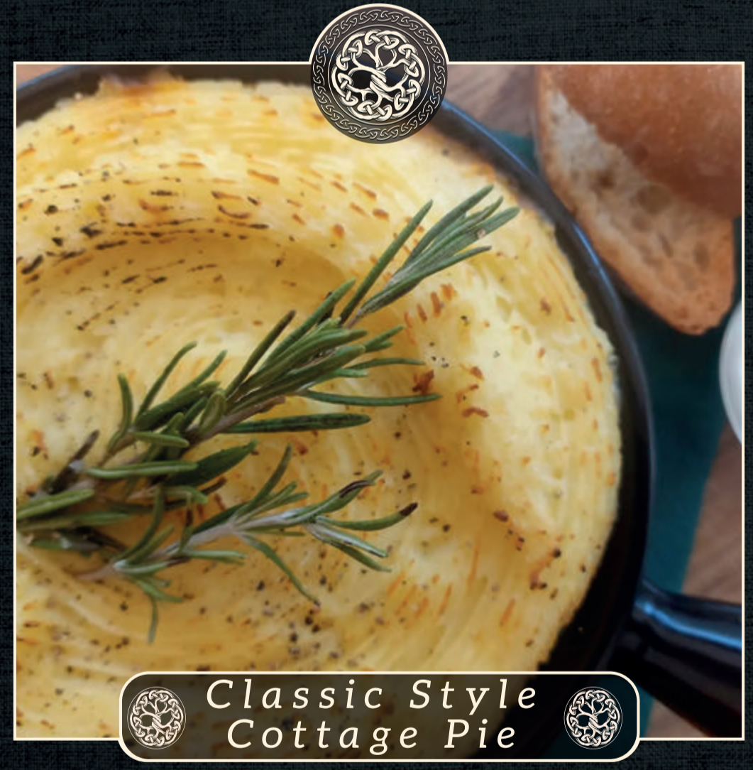
Classic Style Cottage Pie

Beef, shallots & carrots slowly braised in Guinness & topped with puff pastry and a crown of homemade creamy mash. Served with bread & Irish butter