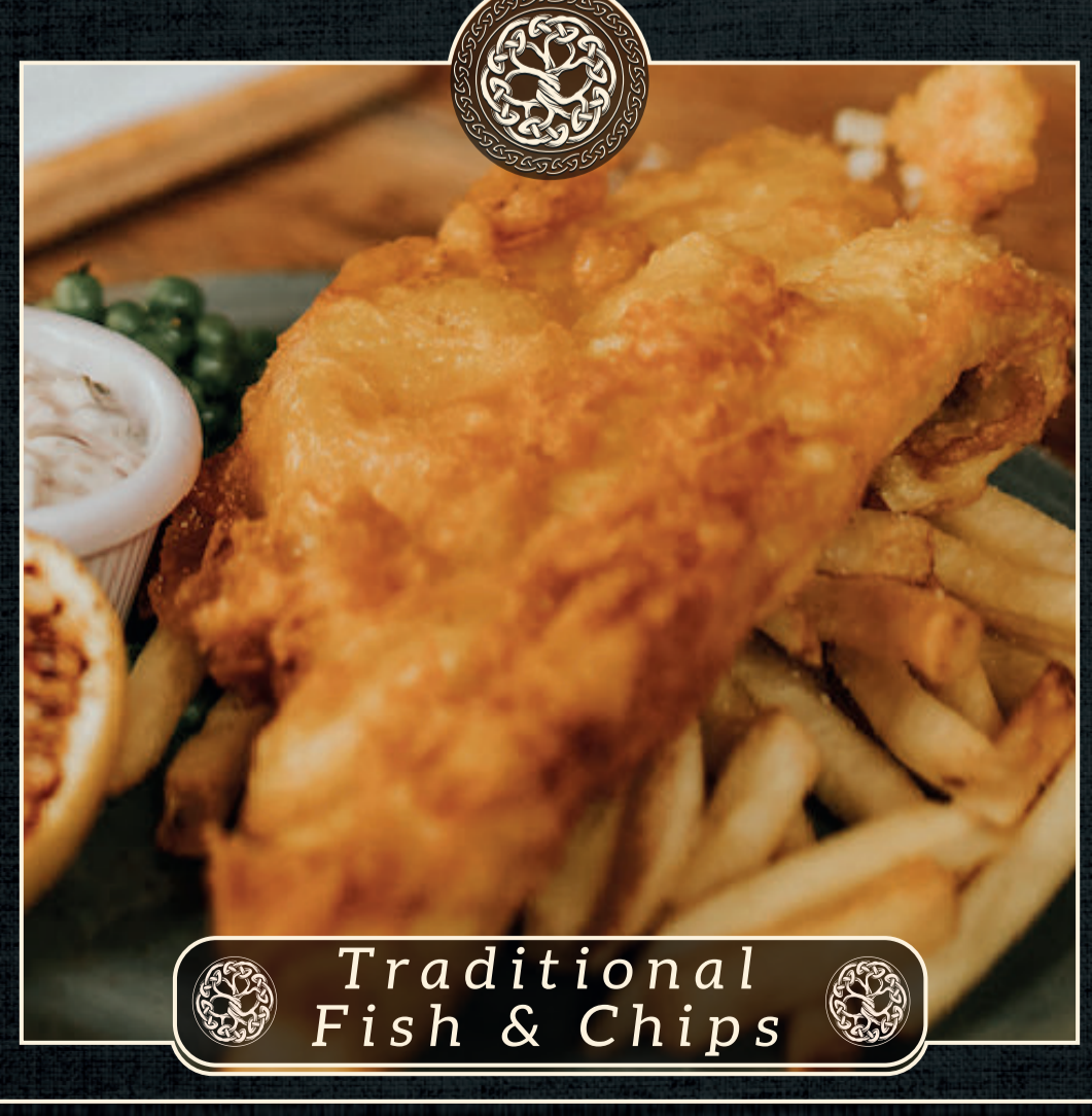
Traditional Fish & Chips

Homemade traditional cottage pie. Freshly minced beef topped with creamy mash and served with toasted bread & Irish butter.