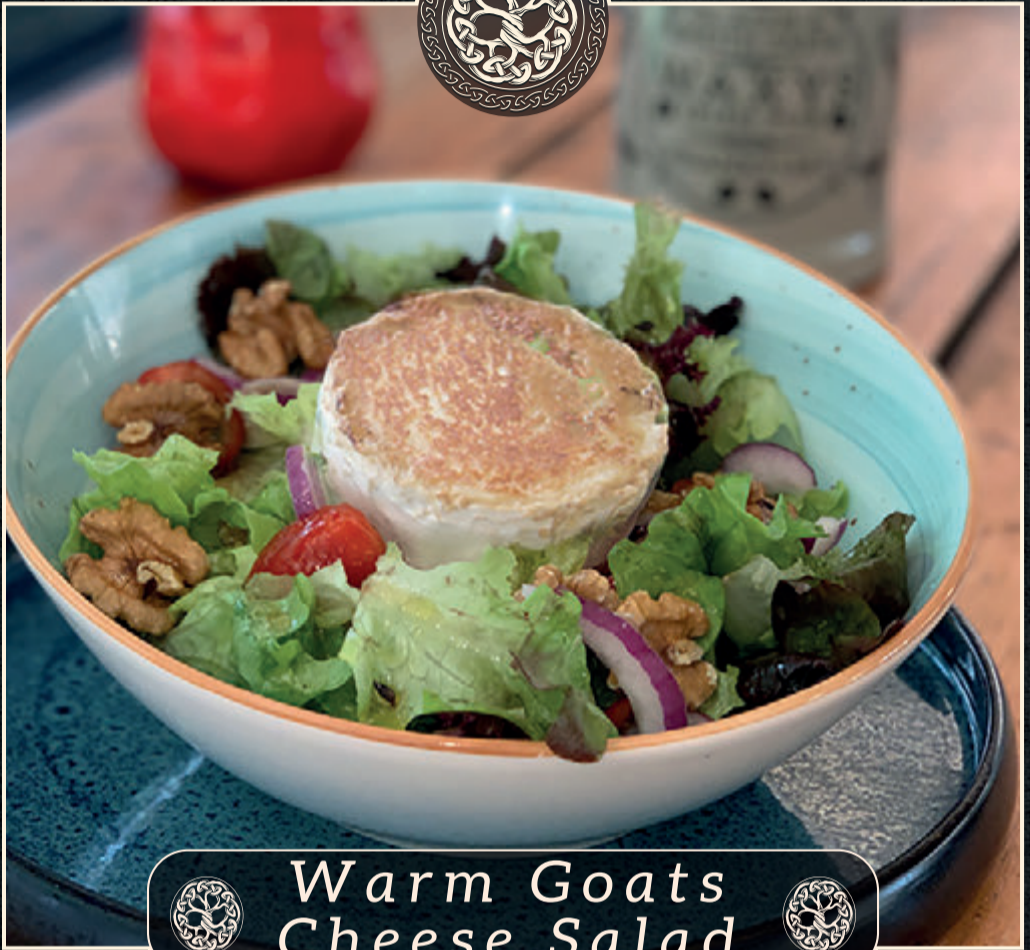
Warm Goats Cheese Salad