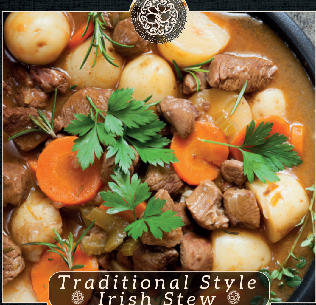
Traditional Style Irish Stew